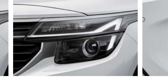
Full LED headlamps*

Projection headlamps with LED DRLs** LED foglamps**