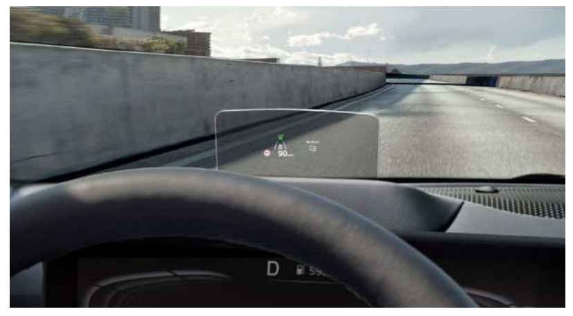
Manual Speed Limit Assist (MSLA) If you drive over the pre-set speed limit, a warning function operates until the vehicle speed returns to within the speed limit. Ex, Ex+, GT-Line only