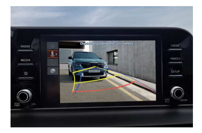
Rear View Camera The Rear View Camera displays video of the situation behind the vehicle for safe parking.