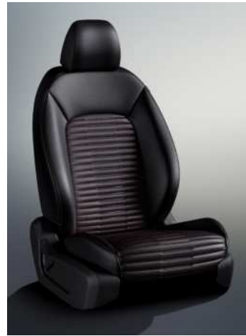
Black artificial leather