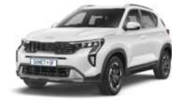
Glacier White Pearl