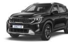
Aurora Black Pearl