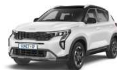
Roof: Aurora Black Pearl Body: Glacier White Pearl