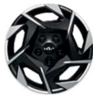
16" Alloy Wheel