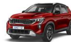
Roof: Aurora Black Pearl Body: Intense Red